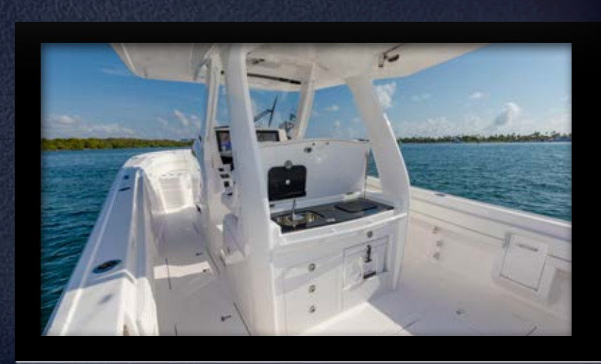
The helm seat station can be customized to fit your every need and whim.