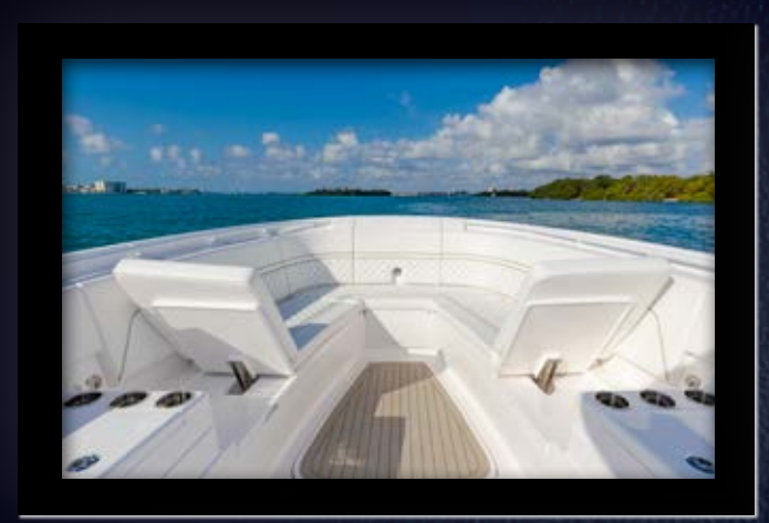
A hi/lo actuating table can sit flush with the cockpit sole, become a filler for the forward seating and raise to table height.