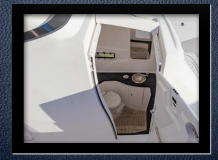
▶ The SE features a comfortable side entry to the head.