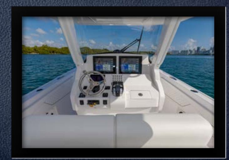
▶ An all new console has space for even the largest of electronics.