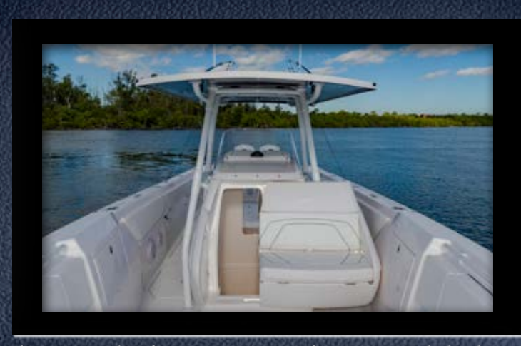
The 375 Nomad FE features an innovative front entry into the head.