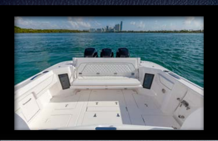
Both models also feature an optional integrated folding rear seat. It's comfortable, convenient and easily folds away and disappears.