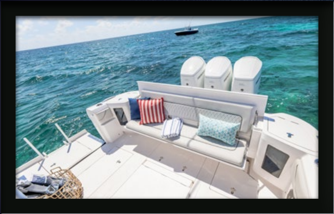
► Twin transom baitwells with windows and optional rear bench seat that folds away when it's time to fish.

Your choice of an optional grill station and sink, plus refrigerators/ice makers, coolers, and electronics invite you to customize the boat of your dreams.