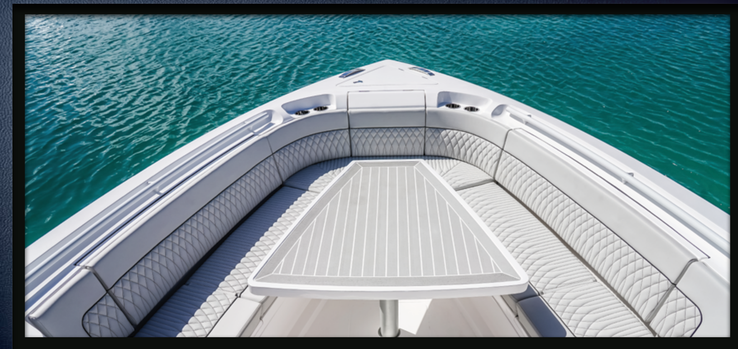
► Forward seating with electric backrests and high-low table that creates a spacious sunpad or goes flush in the floor when fishing.

The FE on this expansive new Nomad stands for the front entry to a spacious hideaway head beneath the helm station. Exceptional comfort and privacy come courtesy of a separate head and freshwater shower, with lighted vanity, sink, and hanging locker with ample storage for toiletries and towels.