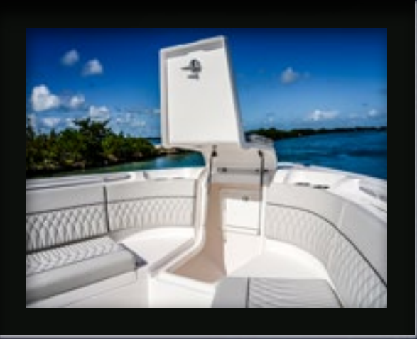
► Optional windlass under hatch provides clean lines and plenty of storage for chain and rope.