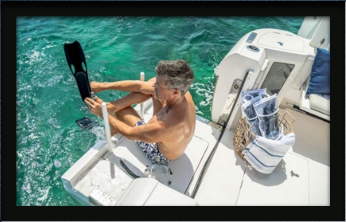
► Hydrophilic swim platform with ladder