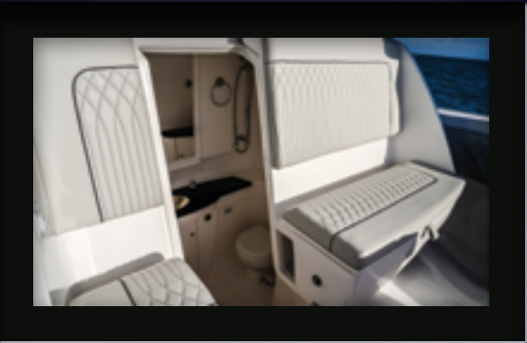
► Separate head with shower, vanity, sink, and hanging locker.

STANDARD FUEL: 700 Gallons / BEAM: 12' 8" / LENGTH: 42' 7" / WATER: 80 Gallons