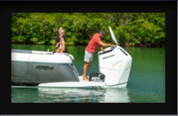
► Large service platform in front of engines makes maintenance quick and convenient.