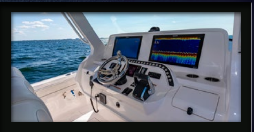
► Expanded console creates space for even the largest flat-screen electronics.