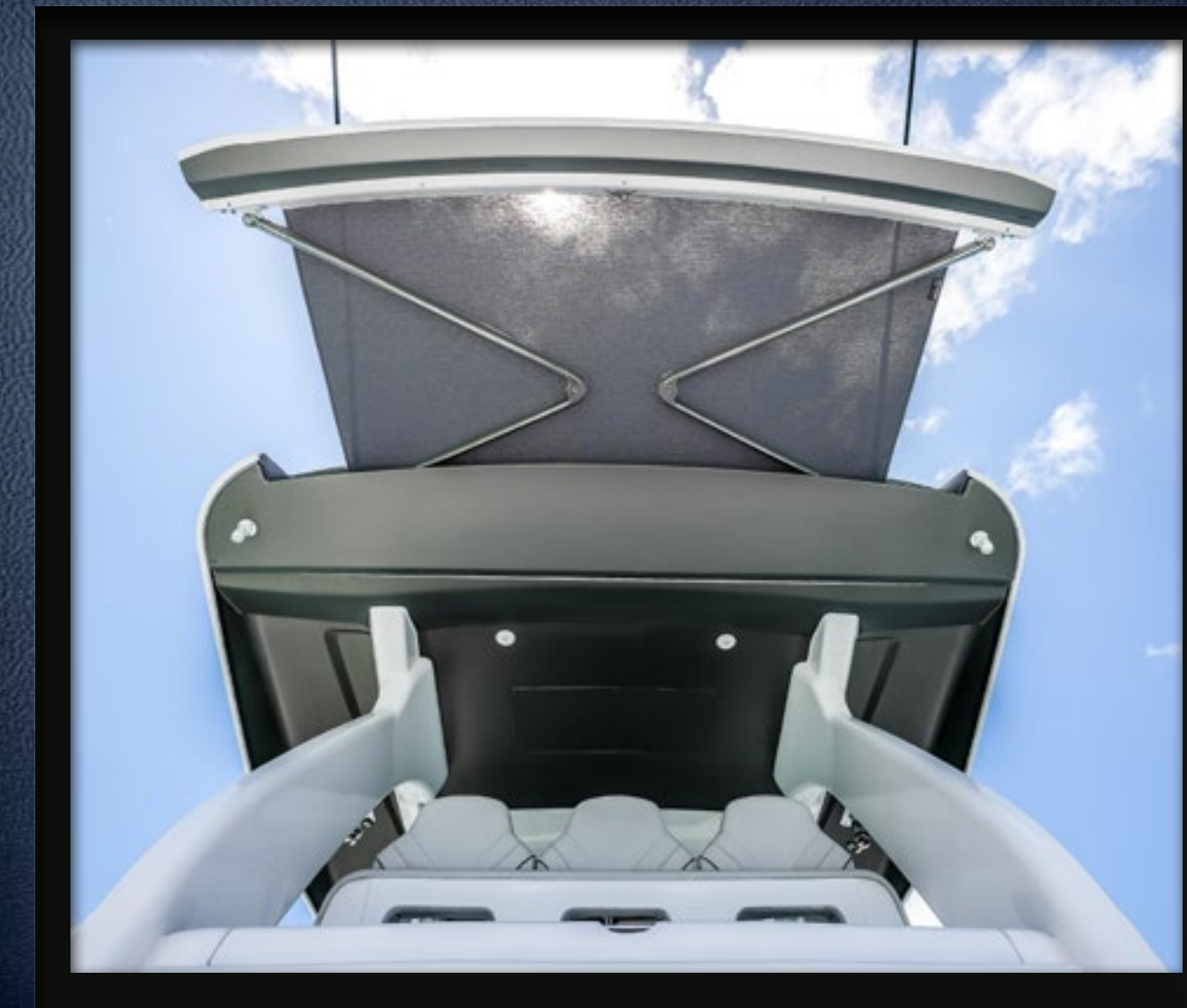
► Standard electric aft sunshade system helps keep everyone cool.

The wide console also offers abundant real estate for your favorite array of today's larger, flat-screen electronics, not to mention additional storage, and endless opportunities for customization.