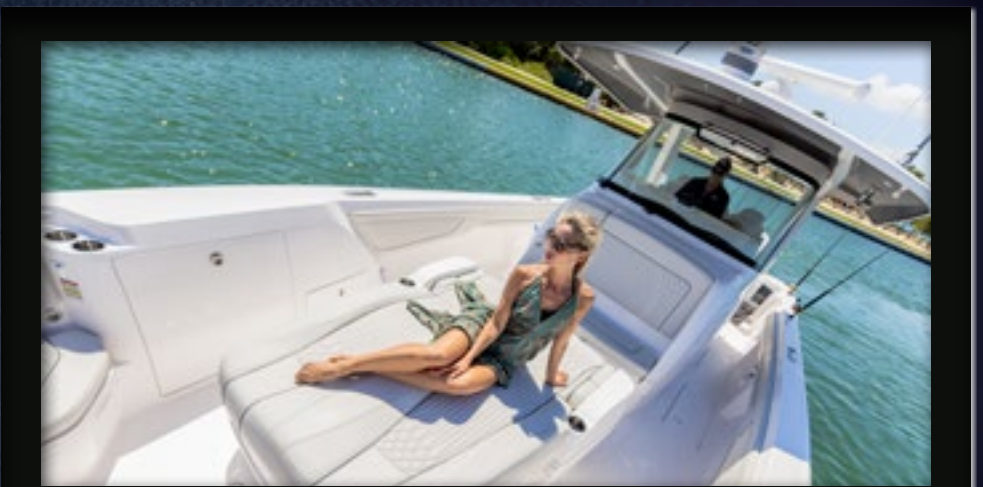
► Full-height glass windshield provides maximum visibility and protection from wind, rain, and spray.