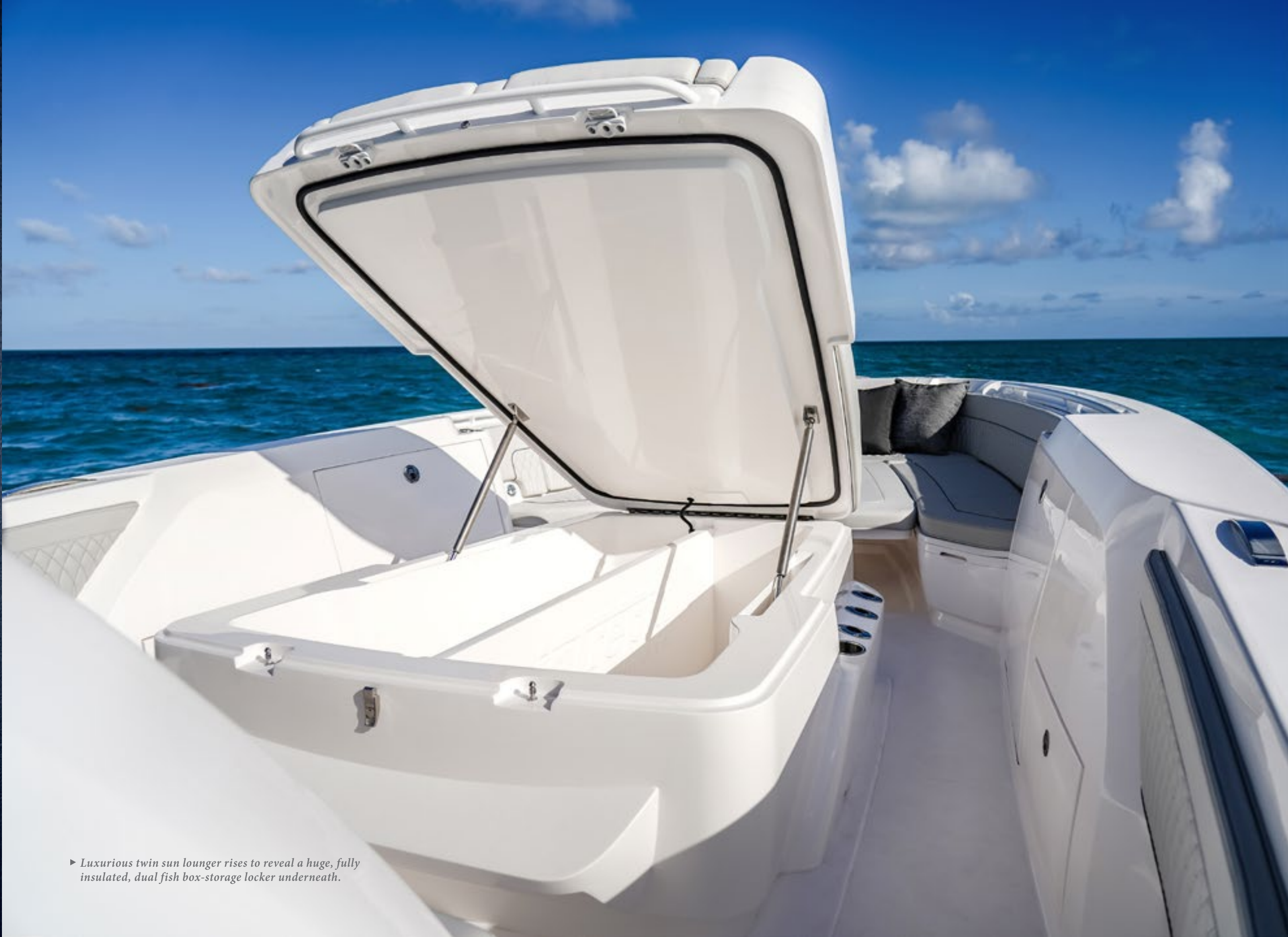
► Luxurious twin sun lounger rises to reveal a huge, fully insulated, dual fish box-storage locker underneath.

Twin transom dive platforms are complemented by our signature swing-in, hullside dive door with fold-out ladder. On the other side of the cockpit, we've added an innovative new feature from our flagship 477 Evolution Sport Yacht that owners absolutely love: a spacious new hydraulic hull platform with fold-out ladder and grab bars that makes it easier than ever to stage up your dive gear, and for one person to assist another in getting in and out of the water. You're welcome.