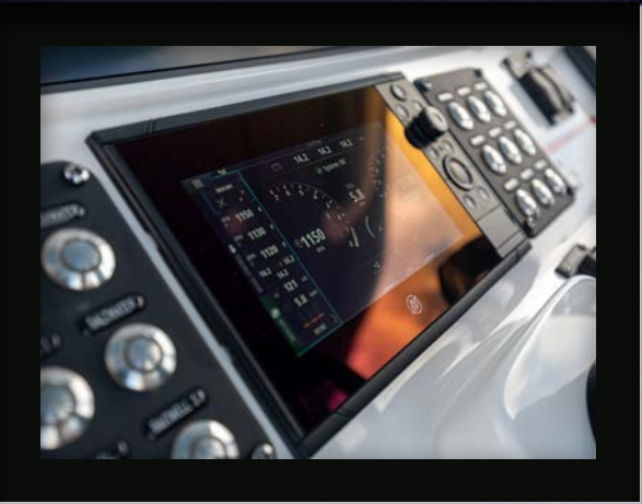
► A console with room for even the largest electronics.

STANDARD FUEL: 320 Gallons / BEAM: 10' 6" / LENGTH: 34' 6" / WATER: 30 Gallons