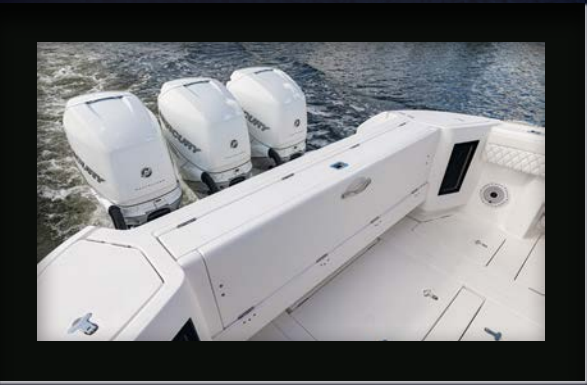
► Power up with your choice of best-in-class engine packages