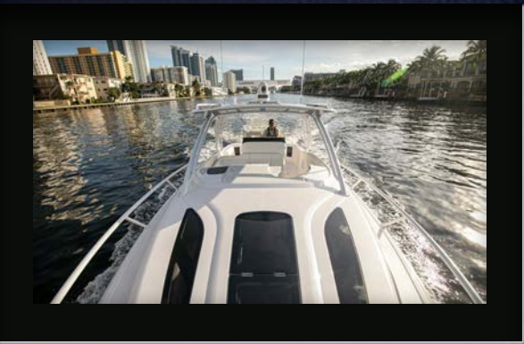
► An elevated helm station and forward cockpit lounge seating with pull-out sunpad provide commanding views.