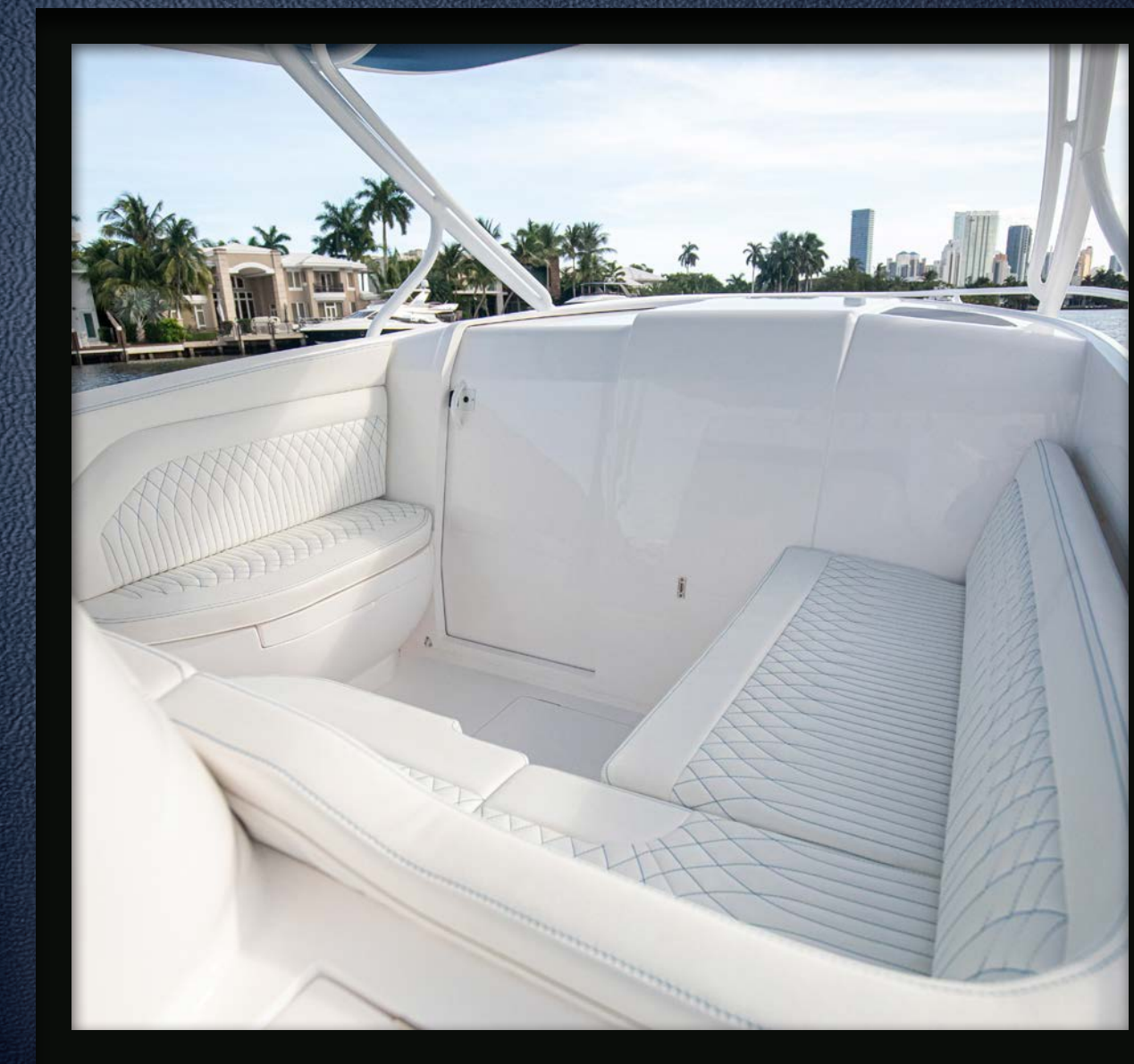
► Spacious forward seating allows passengers to relax in style.

An aft-facing seat beside the helm and spacious, wraparound seating area with retractable lounger and built-in cooler just in front of the helm invite easy interaction between captain and crew. There's even the option of a wraparound windshield to protect the entire bridge from the elements, while offering additional privacy and quiet.