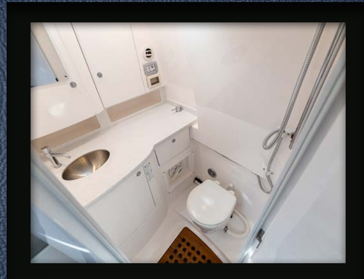
► Private head with vanity, sink, and built-in shower.

A well-appointed galley includes everything you need for dining and entertaining, with an abundance of cabinets and storage space everywhere. The private head with built-in shower complete a gracious ambiance designed to make you and your guests feel perfectly at home on the sea.