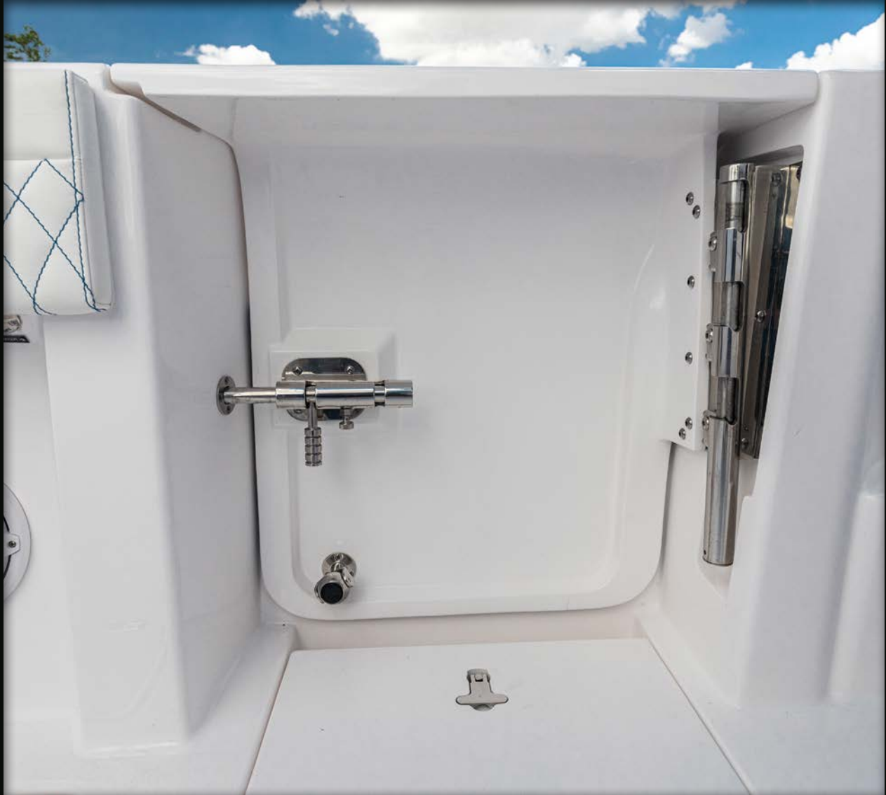
► Hullside dive door, an Intrepid trademark, with our latest lift up and rotate design that doesn't take up valuable cockpit space when in the open position.

For those who fish, the 345 Valor delivers in legendary Intrepid fashion. A customizable cockpit can be rigged with tackle and storage lockers, rod holders, and insulated fish boxes or coolers. Above-deck, pressurized corner bait wells with windows flank a rear bench seat that fold-ups when it's time to reel in your next trophy or table fare.