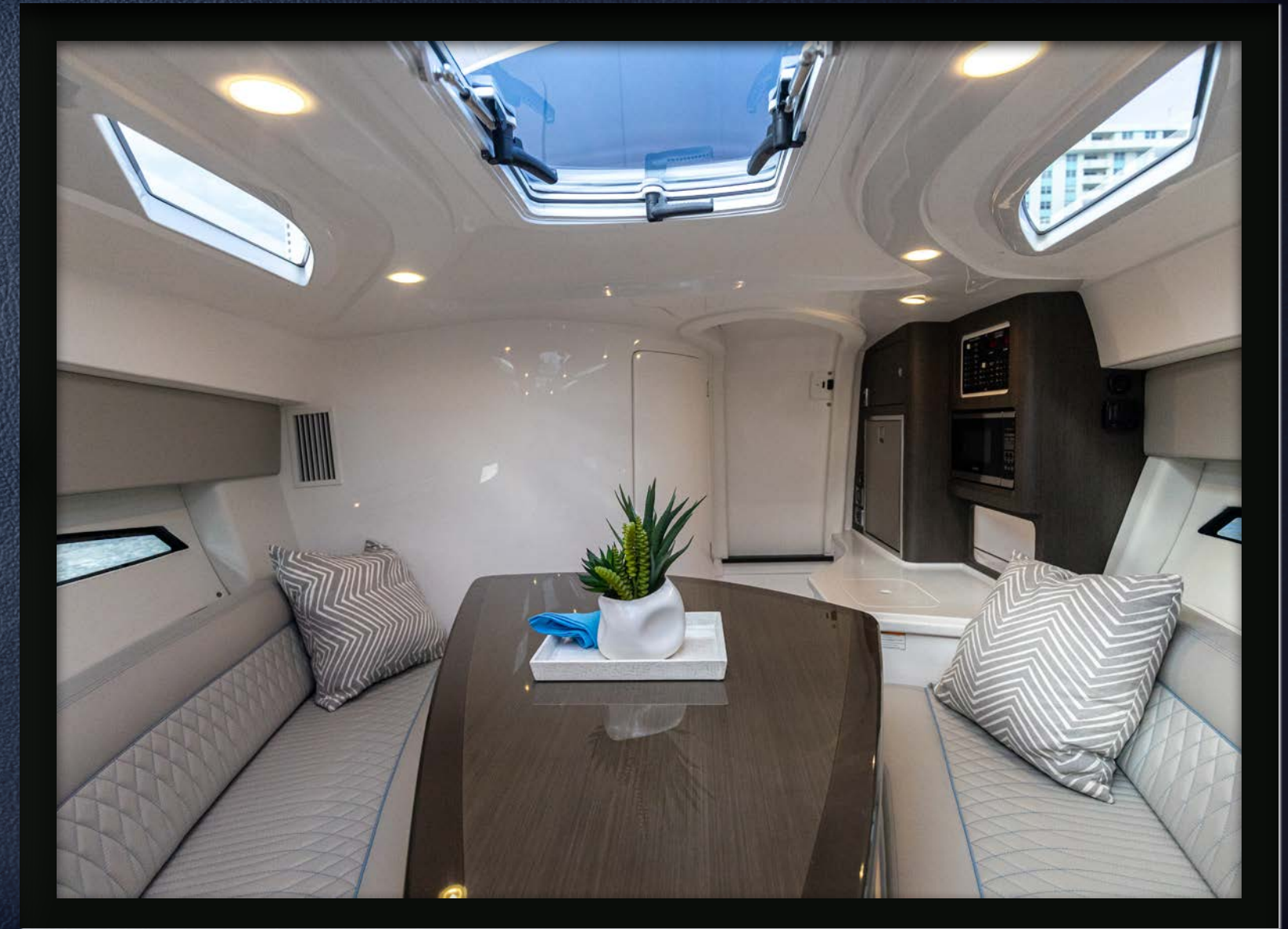
► A luxurious cabin can be air conditioned and personalized with your preferred finishes, electronics, and other accents.