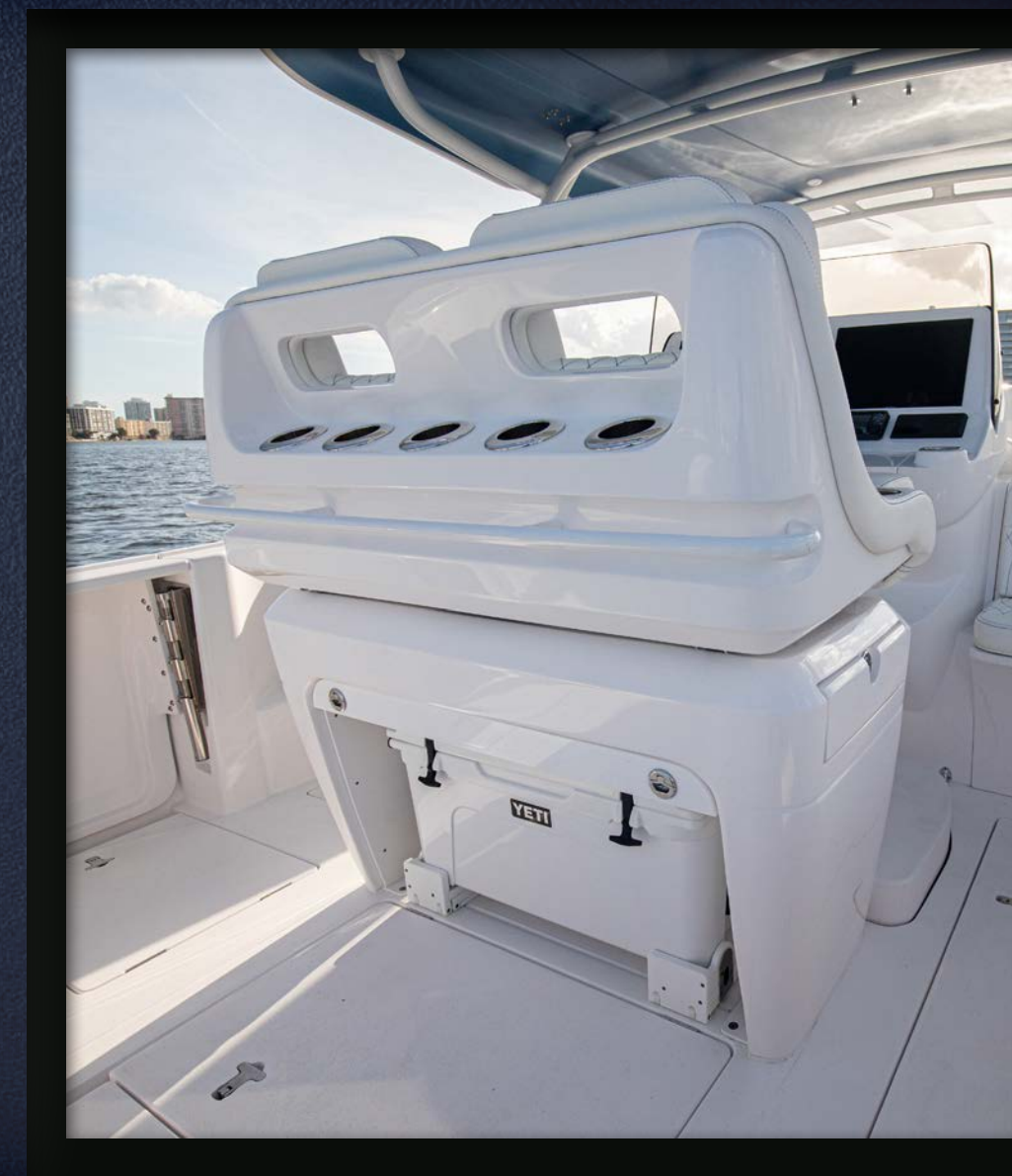
► Custom electrically adjustable helm seat with optional slide-out cooler.