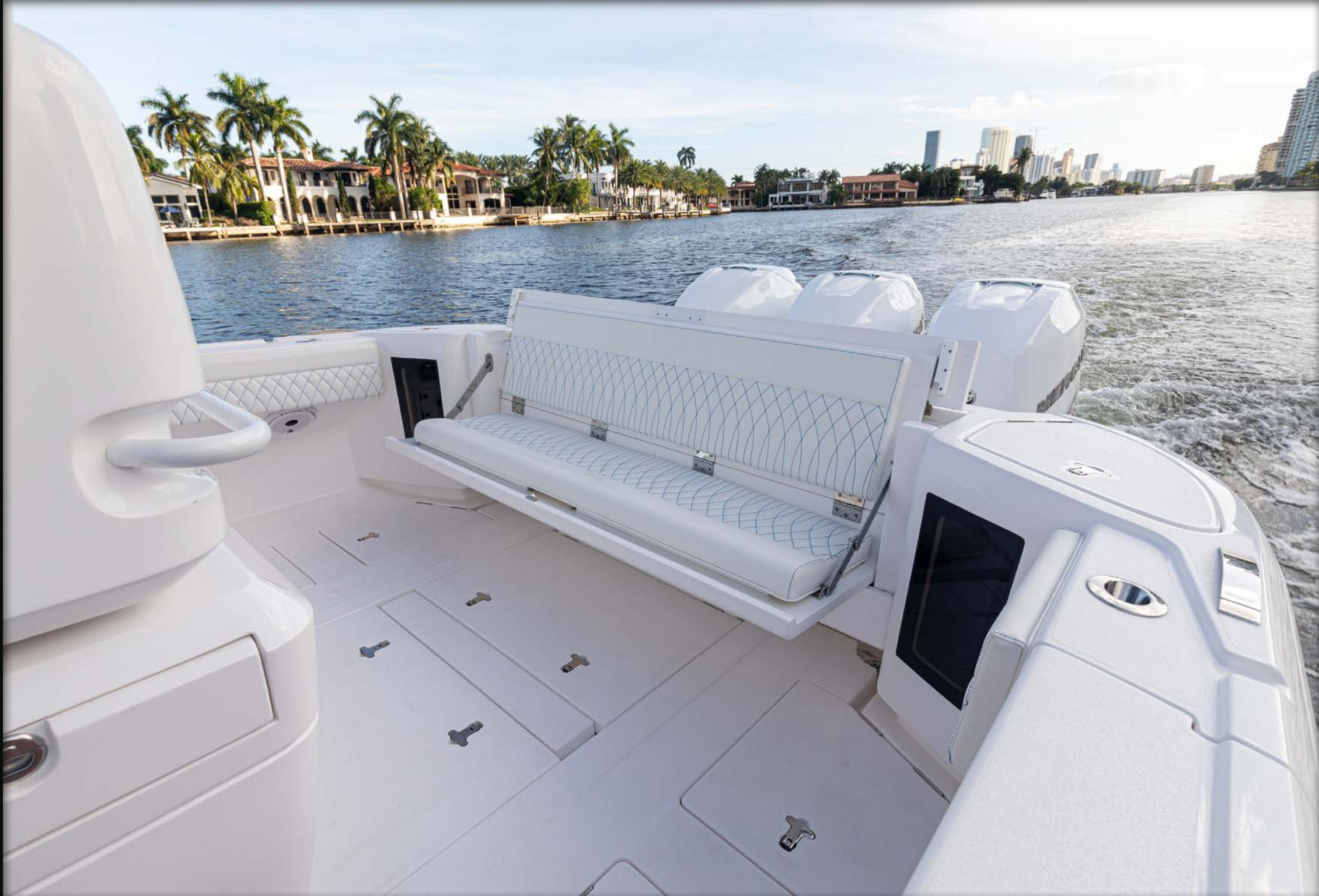
► Cockpit storage compartments can be customized as insulated fish boxes, coolers, tackle or other equipment storage, including above-deck corner bait wells on either side of a folding rear bench seat for when you're ready to run or relax in the sun.