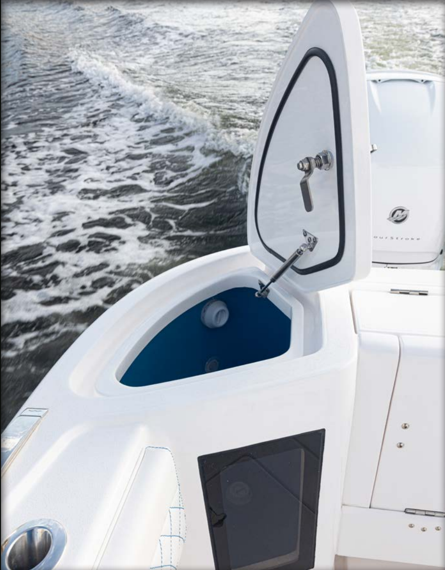
► Custom above-deck pressurized bait wells with windows are tucked into the transom to free up valuable cockpit space.