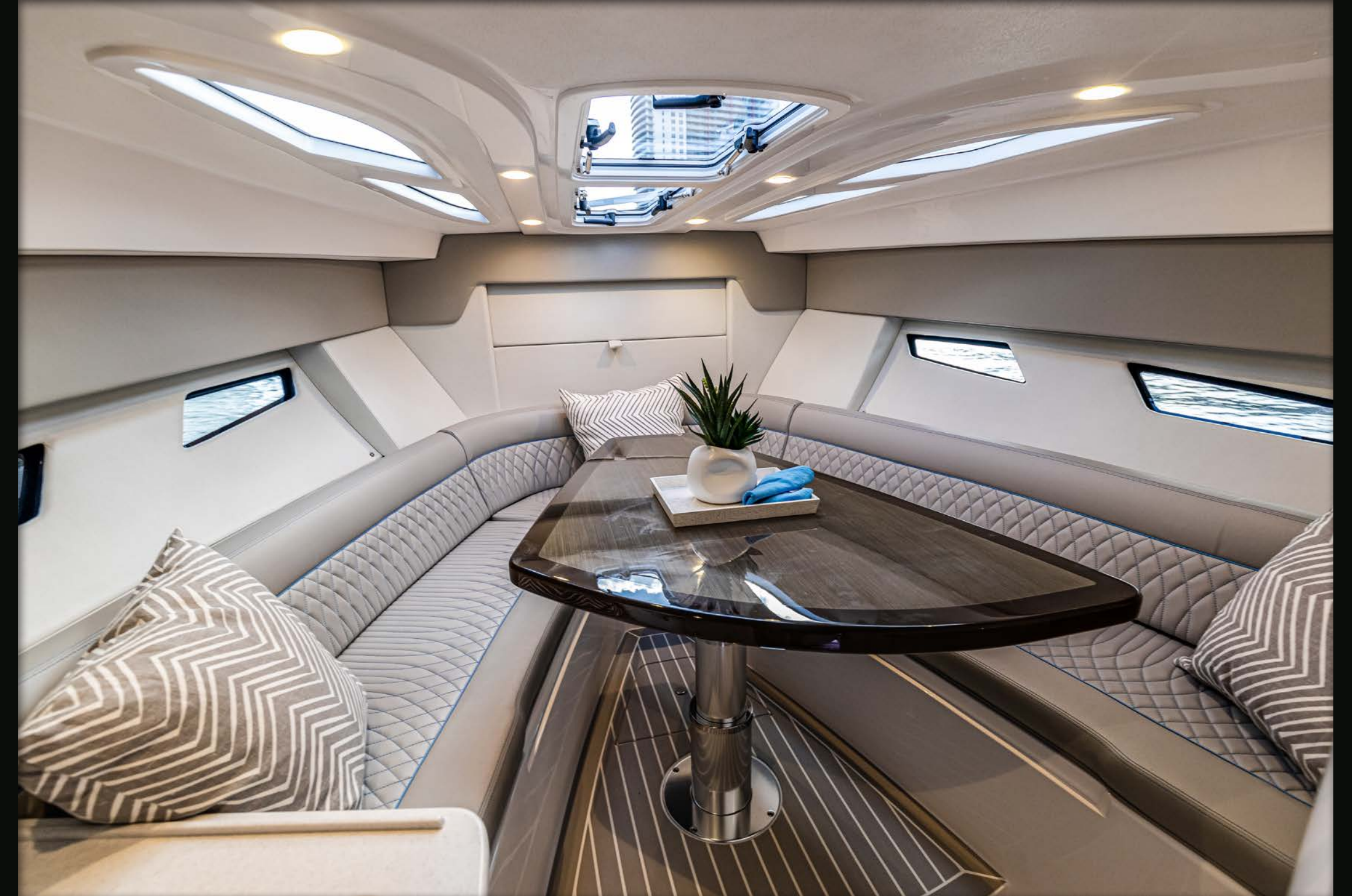
► With a surprising amount of headroom, the spacious queen-berth cabin with optional air conditioning is bathed in natural light pouring vented skylights and large hullside windows.