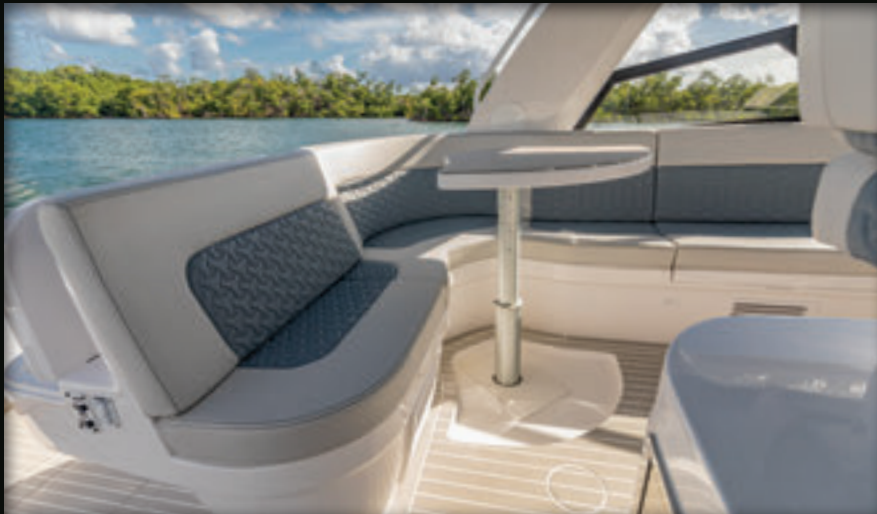
► Hydraulic table fits flush into deck, fills seating or goes to table height

The topside summer kitchen with fridge, grill and sink invites you and your crew to enjoy your fresh catch of the day under the protection of an ingenious electric sunshade that extends out over the entire aft cockpit. Up on the bow, our largest sun pad to date provides more than enough forward lounging space for group socializing and sunbathing.