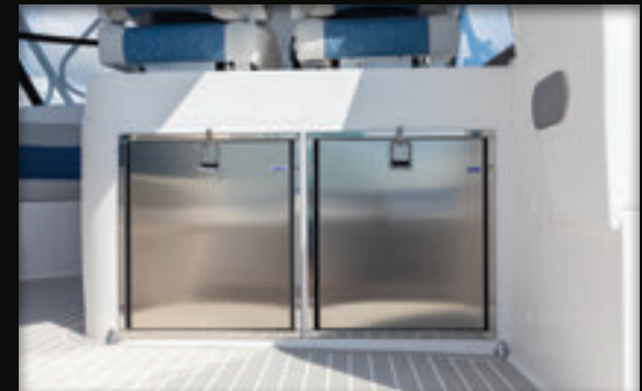
► Dual helm seating features a cabinet large enough to hold a side-by-side refrigerator / freezer