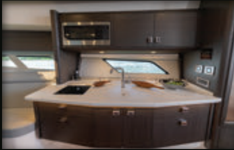
► Fully appointed galley with new Euro-style hardware, cabinetry and finishes

A surprisingly expansive cabin features twin queen-bed state rooms, a fully appointed galley, and an amazing amount of storage. There's a roomy head with separate shower and vanity. A large dining settee seats eight, then converts to a third berth for additional overnight guests. Each custom-built 477 Evolution is rigged and styled with all your favorite equipment, finishes and features, including state-of-the-art entertainment systems. Numerous hull-side windows and skylights flood the cabin with natural light. New accent lighting under countertops and cabinetry set an elegant mood in these yacht-class accommodations for family and friends.