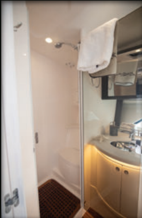
► Roomy private head with separate shower and vanity