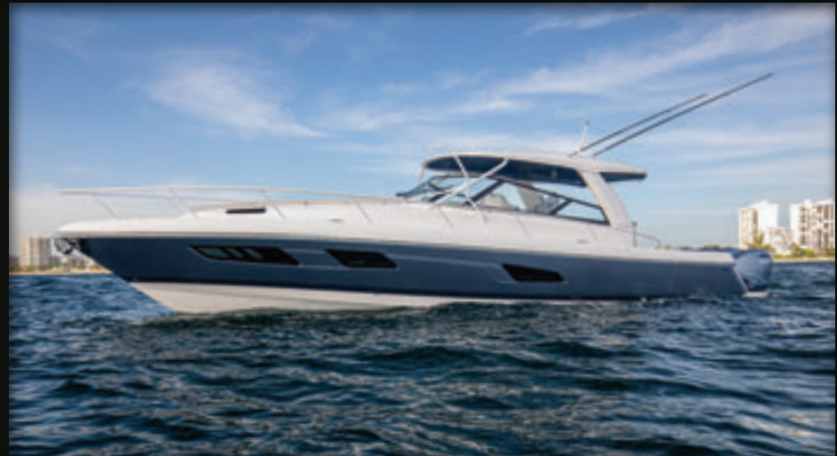
► Large hullside windows let in light and allow you to see out from below deck