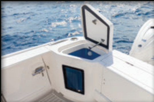
► Spacious aft cockpit with optional folding rear bench seat, two windowed bait wells, insulated storage / fishboxes and summer kitchen with grill and sink