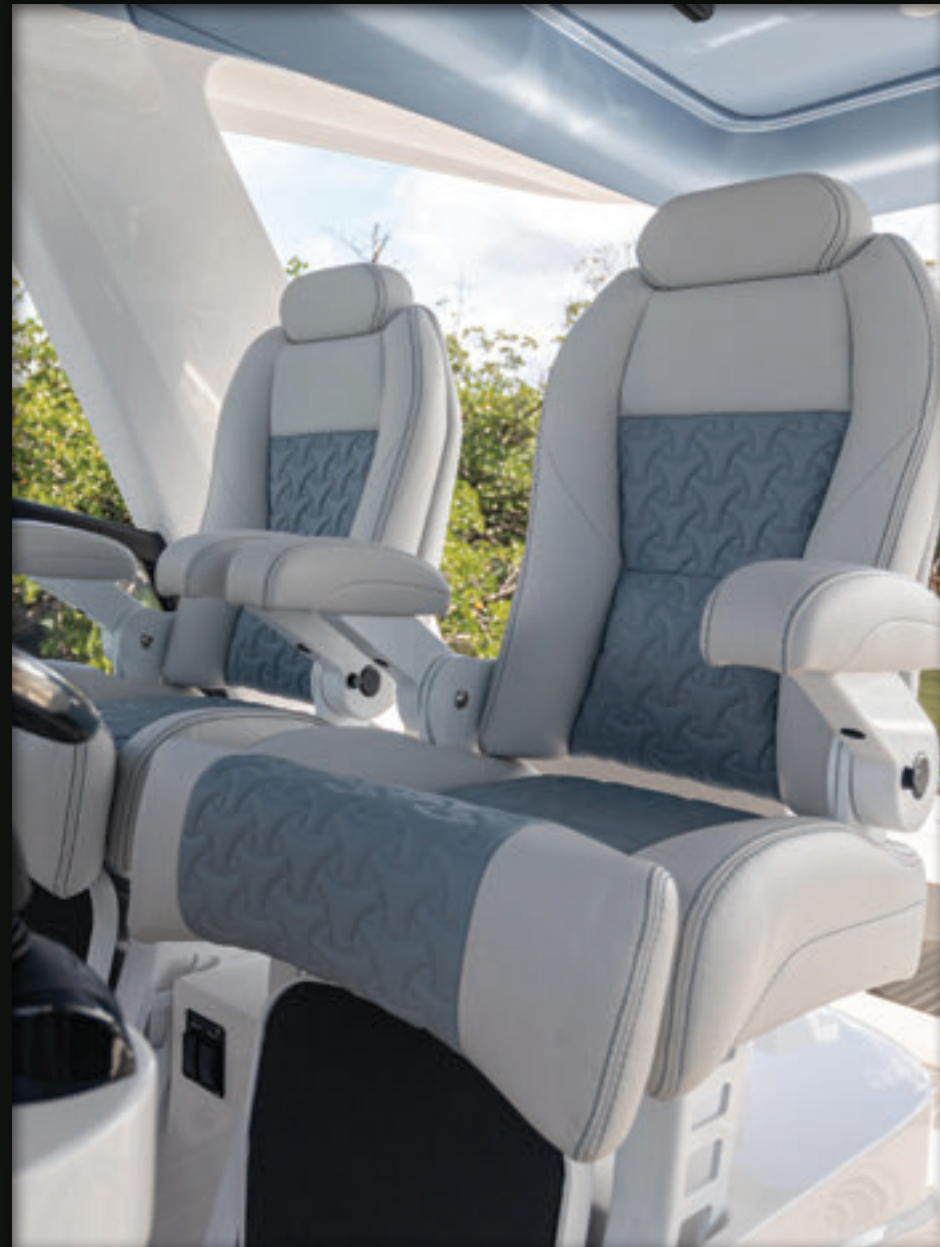
► Twin adjustable captain's chairs