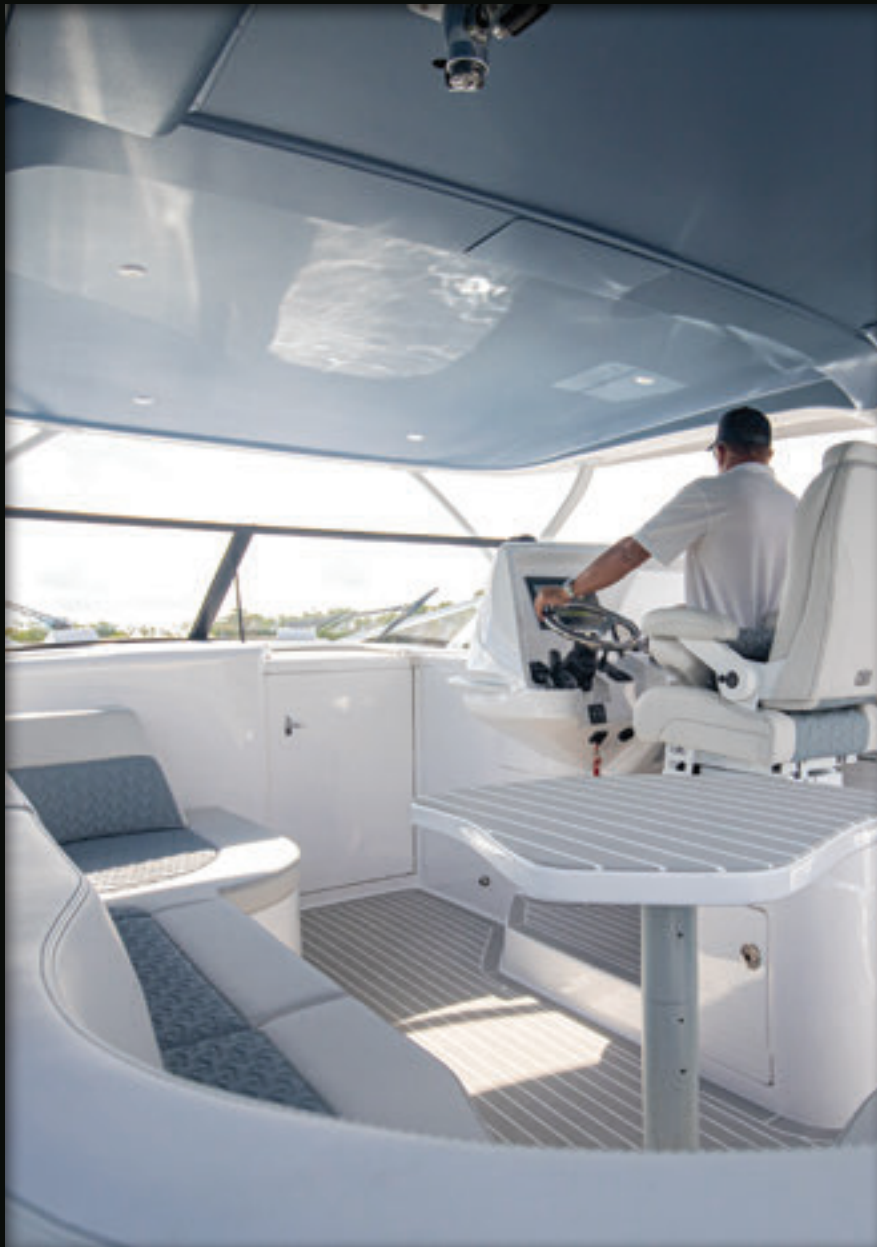
► Oversized bridge deck lounge with wraparound seating and hydraulic hi-low table

With a quad power package, the boat cruises comfortably at 48 mph, achieving top speeds that race up to a pulse-quickenning 68 mph! At any speed, our signature stepped hull design crushes waves and delivers a smooth, dry, sure-footed ride that is unmatched in the industry and instills confidence under any conditions.